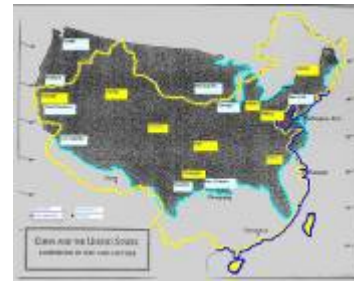
A comparative map of China & the U.S.

The second "Mapping China" meeting moved us as step closer to our goal of identifying a few worthwhile projects to take to the next level. The group decided to focus on taking a close look at US-China geography from a comparative perspective. We used the map below to get oriented and consider what comparative features we would like to focus on and will pick up this discussion in meeting #3, paying special attention to creating very tactile "hands-on" maps for use in the classroom. We can play with them too, and learn quite a bit about Chinese, and U.S. geography in the process.