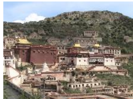
Ganden Monastery, near Lhasa

The 2005 China Council tour to the Eastern Tibetan Plateau was a heavenly success.