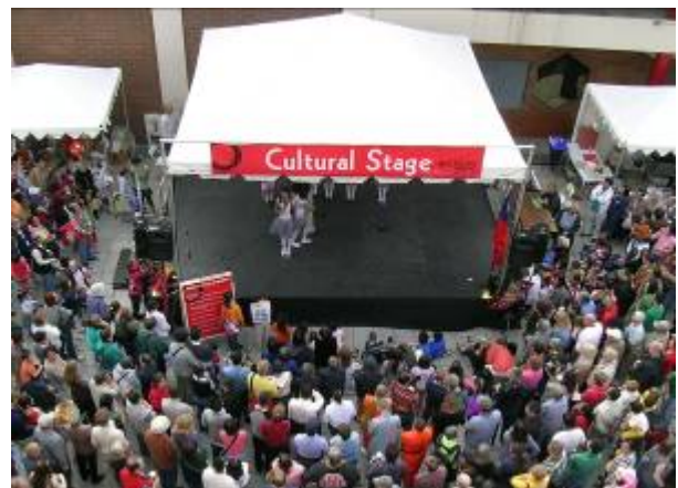
Cultural stage, NW Davis St., October 1, 2006