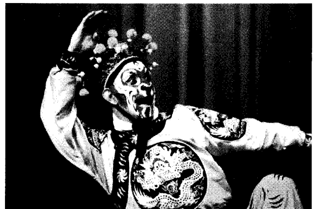
The Monkey King is Coming! See page 2

*Become a member of The Friends of Kam Wah Chung. Annual membership dues are $25.00 Contributions may be sent to Kam Wah Chung & Co. Museum, P.O. Box 663, John Day, OR, 97845.