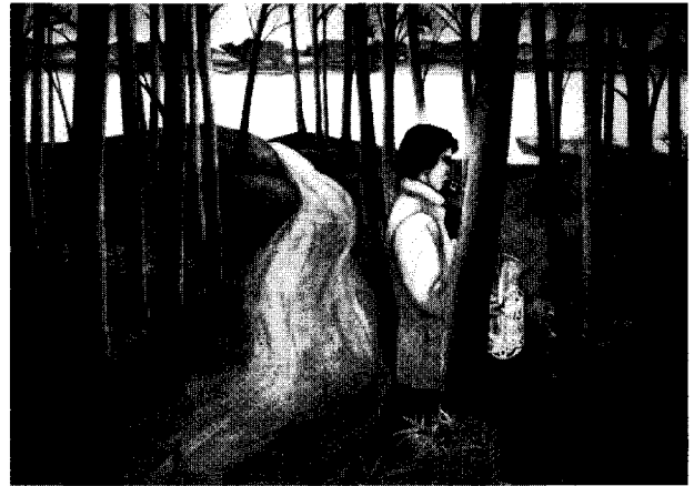
"Country Music" (60" X 40"), Willow Zheng (1987)